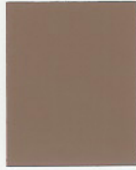
THISTLE BROWN 4B